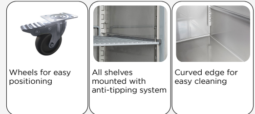
Wheels for easy positioning